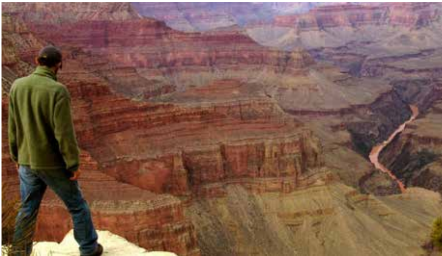
Grand Canyon, Arizona