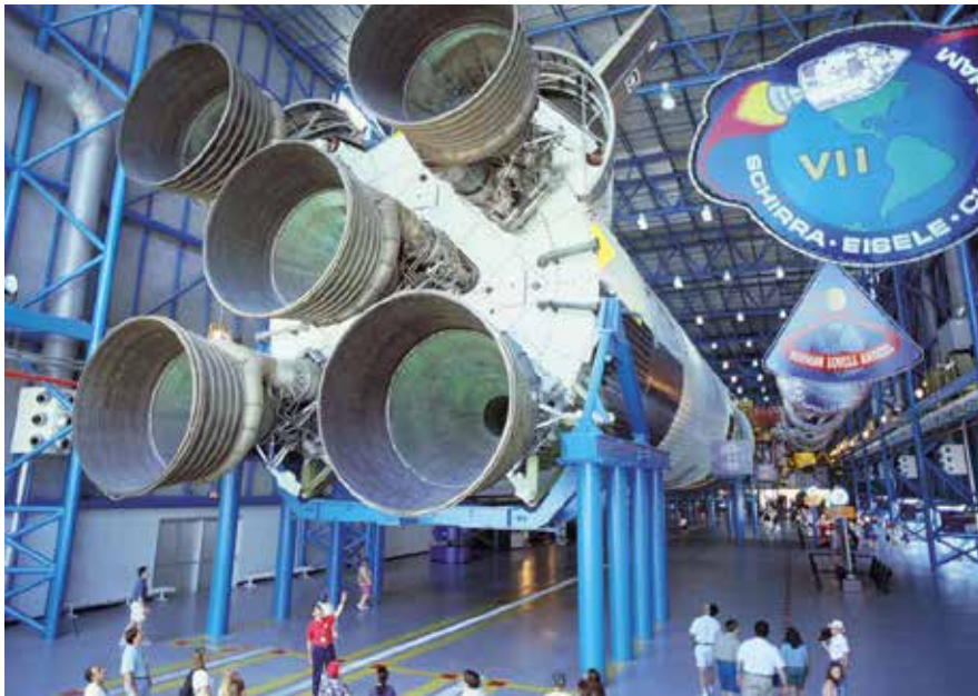
Kennedy Space Centre, Florida

After a leisurely morning, we transfer to the airport for the flight home via Dallas. (Passengers who are returning to Australia on flights other than group flights should make their own arrangements for airport transfers). (B)