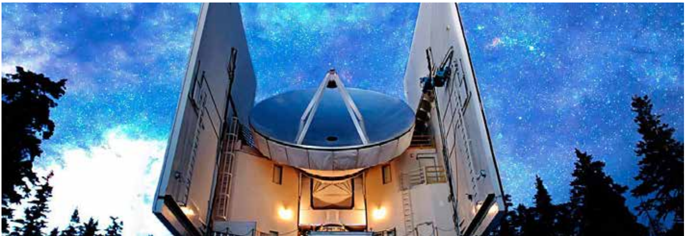
Arizona Radio Observatory, Mt Graham, Tucson, Arizona