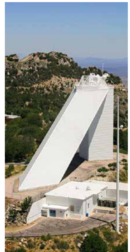
Kitt Peak Observatory, Tucson, Arizona